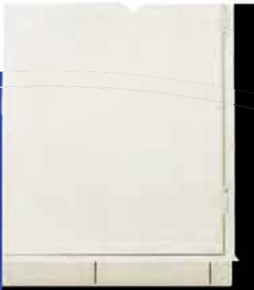
▲ Top landing gate with mechanical interlock that releases only when platform reaches the top of landing